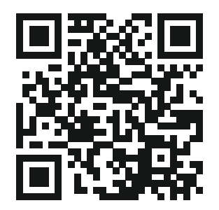
Drain TM/TMW/TMR 32 https://qr.wilo.com/701