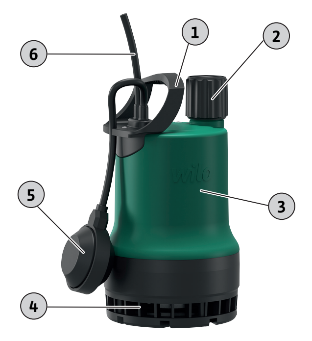
Fig. 1: Overview

Submersible pump for stationary and portable wet well installation. Pump with fitted float switch for fully automatic operation.