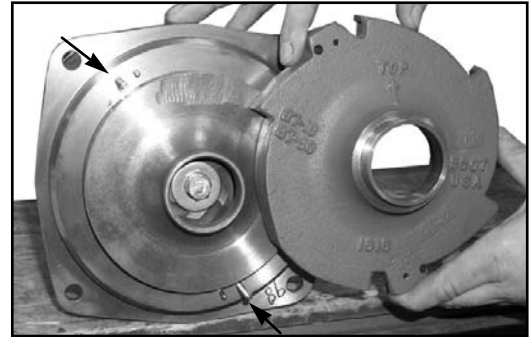
Figure 1 — 8716 & 8717 Models Only